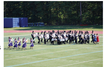
Congratulations to the JTHS Marching Band for their first place finish at the Metuchen Marching Band Competition.

Spanish 2CP students are almost done with their initial review. As a summative project, the students will be creating an alter ego. The alter ego will be either a superhero or a villain. They should prove to be very creative. Spanish 1CP students are working on a project about Spanish Speaking countries. This project is appropriately timed to help celebrate Hispanic Heritage Month. Spanish 5CP students are working on a unit titled Life and Feelings. They will be discussing the things that make human beings fight for survival despite the uncertainties and circumstances of life. The fledgling Spanish Club had its first meeting and is hoping to make a positive impact on the JTHS community. Students in French II Honors, French IV Honors, and French AP classes started the year by reading a current event article in French. Then each student selected his or her own article to read and to present to the class. To prepare for this, students have reviewed and practiced different ways to ask questions in French and how to use the correct verb conjugations and tenses in their presentations and questions. As a result, they are using the language as well as learning a lot about Francophone cultures.